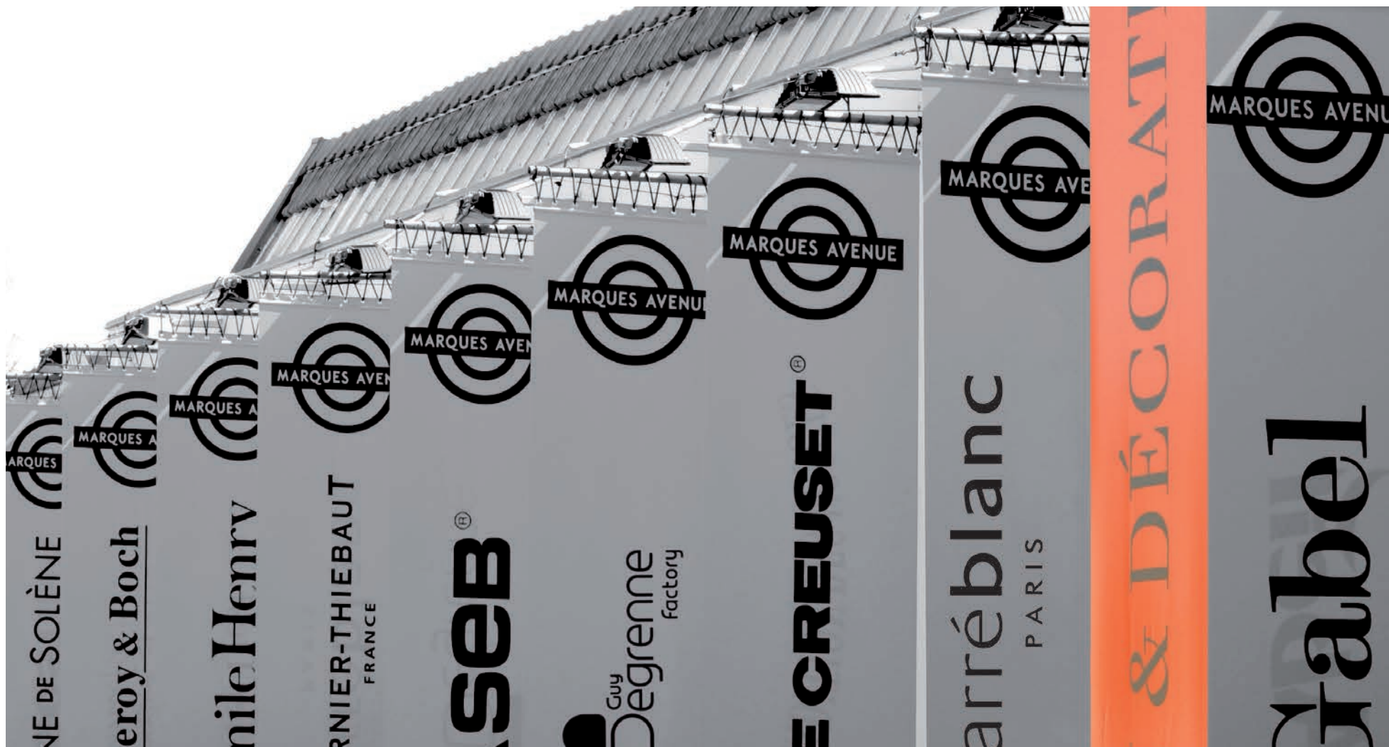
MARQUES AVENUE MAISON & DÉCORATION IN TROYES : IN THE HEART OF EUROPE'S OUTLET SHOPPING CAPITAL